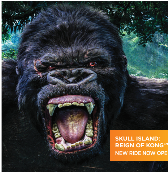
SKULL ISLAND: REIGN OF KONG™ NEW RIDE NOW OPEN